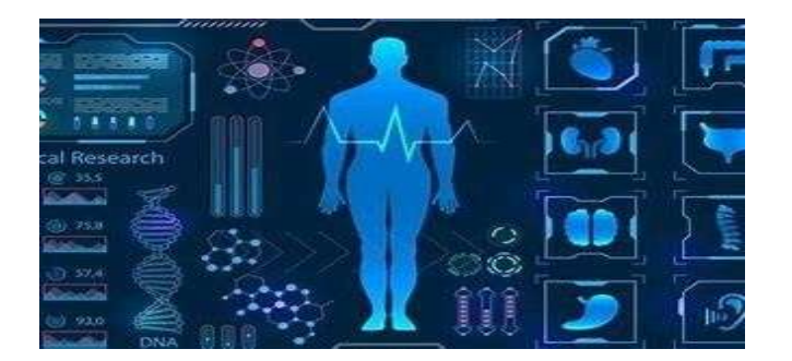
Figure 1: AI in health care

Forex: the analyst gathers the information in eye tissue and spinal cards from a great many patients, then, at that point discovers the calculations with this data.