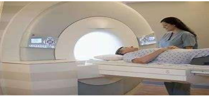
Figure 4: Magnetic Resonance Image

Ultrasound symbolism with AI capacities can analyze arrhythmia all the more contrasted with conventional ECG tests. the AI- controlled, cloudbased AI- Rad Companion from SIEMENS Healthiness. On account of profound learning calculations, the arrangement helps radiologistsrecognizing and consequently featuring irregularities, estimating injuries, dividing life structures, explaining the area, making a deviation map, and producing a report. At the