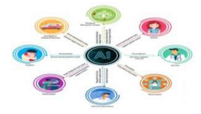
Figure 6: The architecture of smart health systems using AI

where AI upholds specialists' patients, attendants, crisis clinical service, radiologists, clinical research centers.