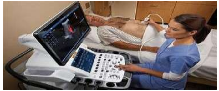
Figure: 3 Ultrasound System

Ultrasound imaging frameworks utilize sound waves to catch pictures of inward organs to analyze sores in livers, hearts, and kidneys and